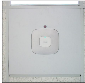
24" x 24" x 1.5" MIMO Universal Ceiling Tile Enclosure