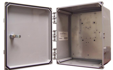
12x10x6 Enclosure with Solid Door, CAT60 Lock

TerraWave Solutions provided the hardware for the overall solution and included ceiling tile enclosures that keep the AP above the ceiling while the antennas are mounted from below. This particular configuration keeps the need for infection control measures to a minimum since the plenum area remains closed and if work needs to be done on the AP, the enclosure can be opened in the work area. All of the enclosures include a CAT60 lock for maximum protection from theft and tampering. The heated and cooled enclosure offers maximum protection for the wireless equipment no matter what the weather is.