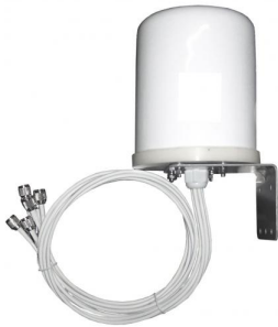
2.4/5 Ghz 6 dBi MIMO Outdoor Omnidirectional Antenna