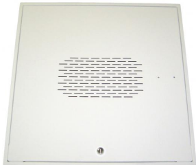
24" x 24" x 4" MIMO Ceiling Tile Enclosure with Key Lock