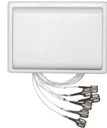
2.4/5 Ghz Mini MIMO Ceiling Mount Omnidirectional Antenna